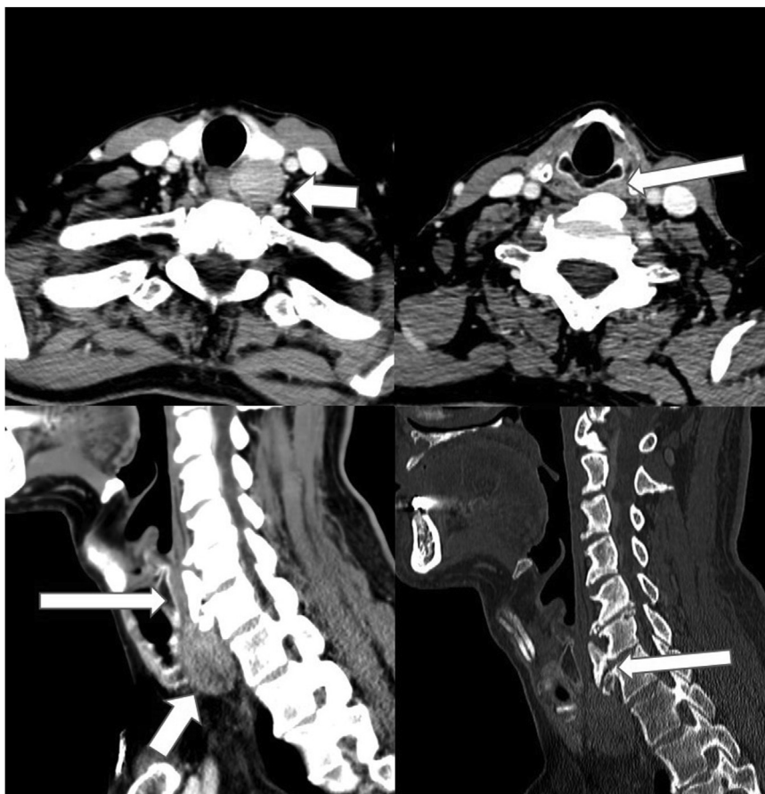
Fig. 1. Computed tomography revealed an oval, well-circumscribed solid mass located posterior to the left lobe of the thyroid gland (short white arrows). The mass showed less enhancement compared with the thyroid gland. Massive anterior osteophytes of the cervical spine at the C6 to C7 vertebral levels were noted, impinging on the posterior wall of the hypopharynx (long white arrows).