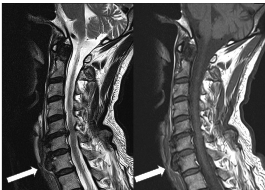
Fig. 2. Sagittal T1- and T2-weighted magnetic resonance imaging revealed disc degeneration at C5 to C6 and C6 to C7 with cervical spondylosis and ventral osteophyte formation. Massive cervical osteophytes at C6 to C7 caused indentation of the posterior pharyngeal wall.